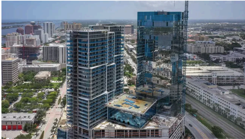
Major high rise construction and real estate development in downtown West Palm Beach

New office towers in downtown West Palm Beach, or already completed ones, such as 360 Rosemary, have lured about 100 firms since 2019 to Palm Beach County.