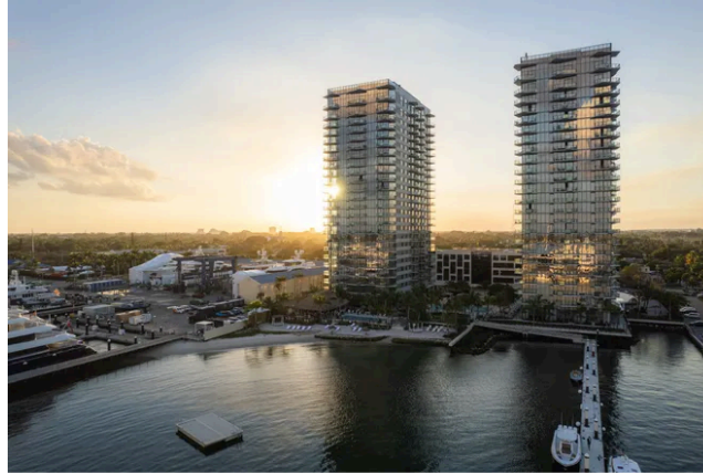
The Cove Club is a newly-opened private membership club in West Palm Beach. Cove Club

During the winter season, however, demand for restaurant reservations exceeds the supply.