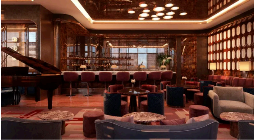
Rendering of the Bellini Rooftop Club, a private social club slated for the top of the Mr. C Hotel & Residences coming to West Palm Beach.