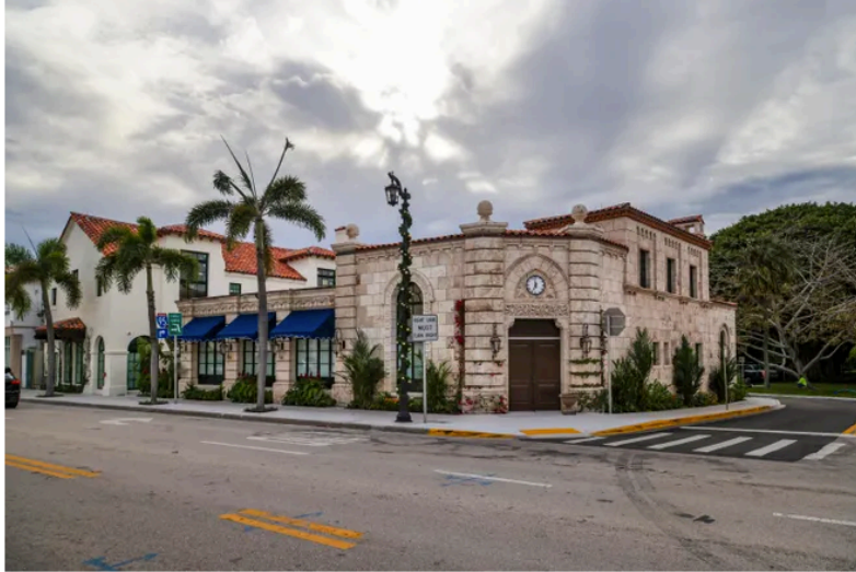
The Carriage House, an English-style social club, at South County Road and Phipps Plaza in Palm Beach.

Celebrities sightings are frequent. Photographs are not because photos are strictly forbidden in the property.