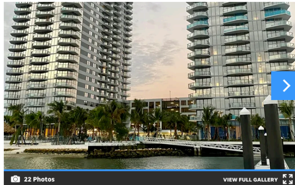
Icon Marina Village in West Palm Beach The waterfront Icon Marina Village is the first rental development on West Palm Beach's waterfront in decades.

Meanwhile, along the Intracoastal Waterway, the party already has started at the Cove Club, at 4444 N. Flagler Drive, part of the Icon Marina Village apartment complex.