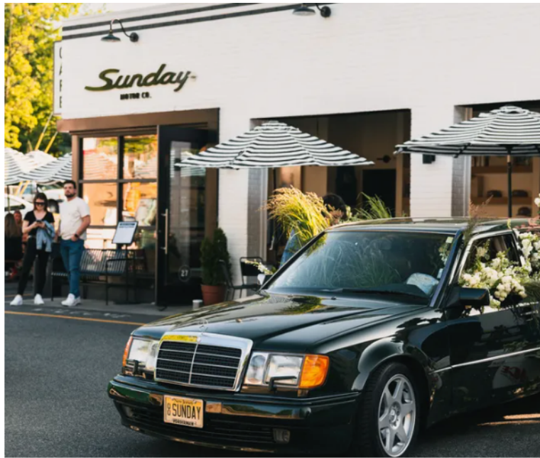
Sunday Motor Co. Cafe in New Jersey.