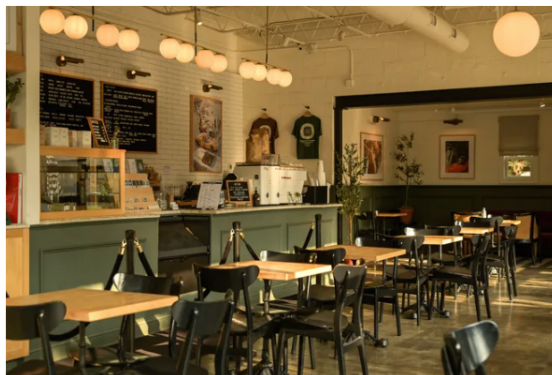
Sunday Motor Co., a New Jersey coffee shop and cafe coming to West Palm Beach. Sunday Motor Co.