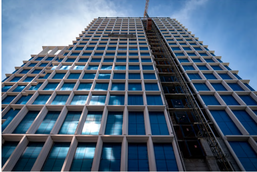
One Flagler is an ultra-luxury office building being built on February 1, 2024 in West Palm Beach, Florida.

Setting their sights on opening in mid-2025, this renowned Greek seafood restaurant by celebrated chef Costas Spiliadis will be located in the new One Flagler. It will feature fresh fish and seafood flown in daily from the Greek Islands. Seating nearly 300 people, the restaurant is designed as a modern homage to the Greek landscape, featuring flowing indoor and outdoor spaces that reflect simplicity, elegance, and harmony.