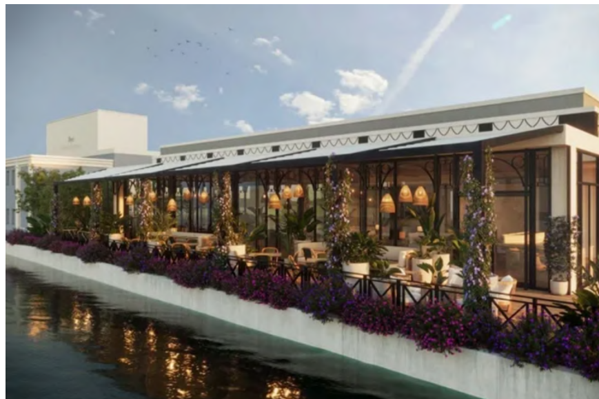
An early artist's rendering of Tutto Mare at The Royal Poinciana Playhouse in Palm Beach.