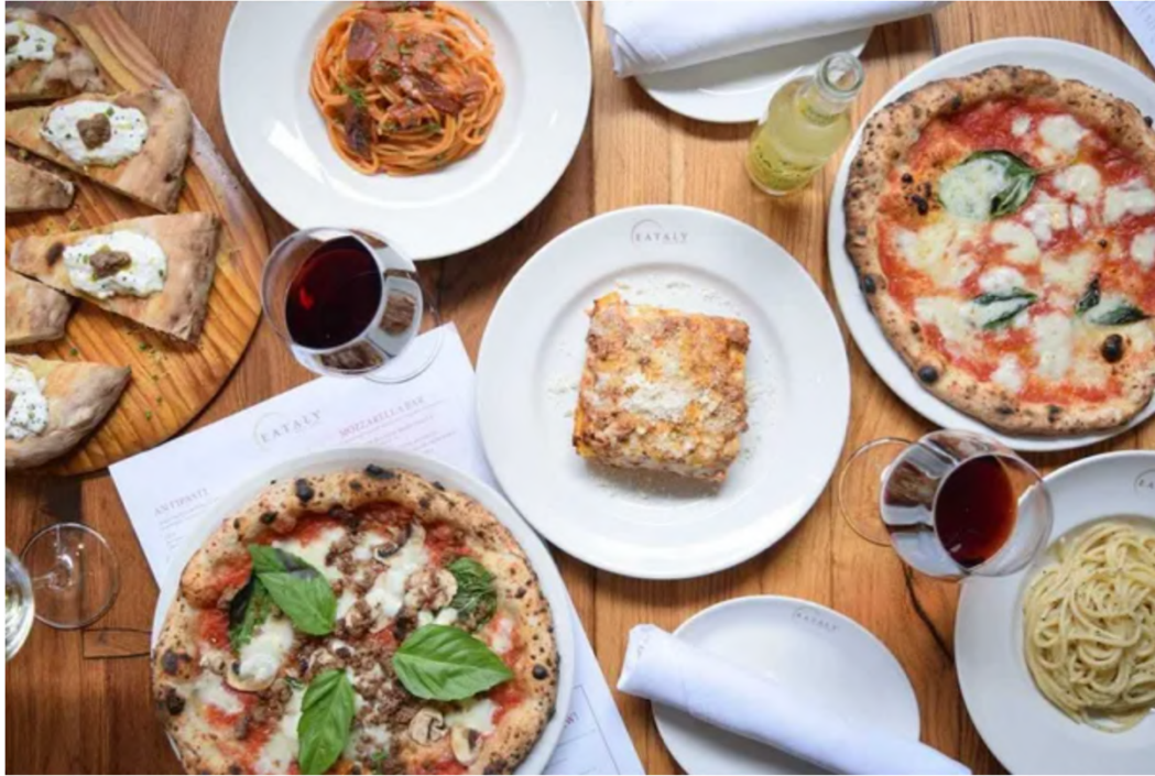
Featuring imported Italian goods, prepared foods, seminars and more, Eataly will open at CityPlace in West Palm Beach in fall 2025.

Expected to arrive at CityPlace in downtown West Palm Beach in fall 2025, this world-renowned Italian food hall will offer a huge variety of imported Italian goods, quick service counters and more. Eataly will take its place pretty much center stage at the complex in the Harriet Himmel building. The structure is in the heart of CityPlace and was built in 1926. Originally a church, it is currently undergoing renovations in preparation for Eataly's arrival.