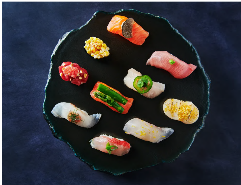
Moody Tongue Sushi will open this January at the Hilton West Palm Beach in downtown West Palm Beach.