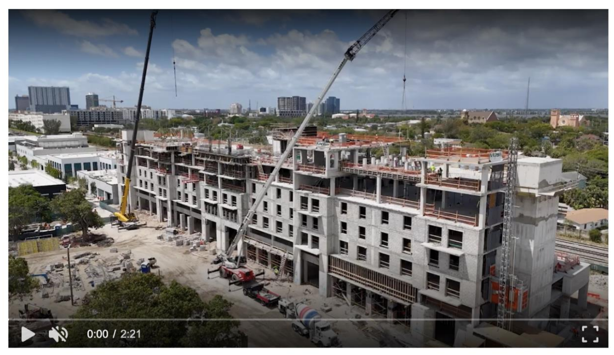
See video of Nora District shopping, dining and entertainment making way in West Palm Beach

Nora will be a center of dining, entertainment and community gathering just north of bustling downtown West Palm Beach.