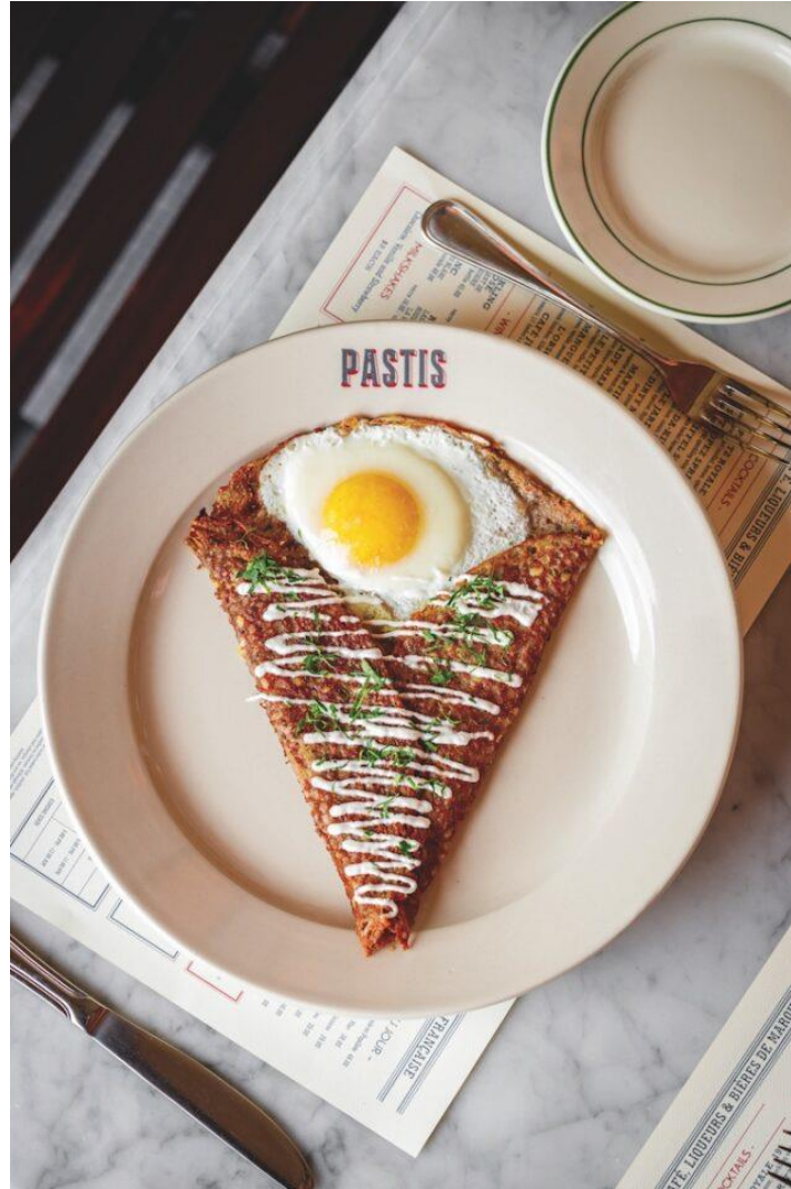
A crepe at the Parisian-style brasserie Pastis.

Finally, the Nora District development continues apace, and this spring, diners can enjoy three new restaurants—rustic Italian fare at Indaco, Mediterranean-style seafood at Del Mar, and Parisian-style brasserie favorites at the latest outpost of Manhattan’s Meatpacking District’s legendary Pastis. Those on the go can grab nutritious juices and smoothies at Celis Juice Bar. norawpb.com